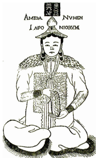
Fig. 1: Amida in Athanasius Kircher’s Oedipus Aegyptiacus , vol. 1 (1652), p. 404.

Our second stop is therefore Kircher’s China Illustrata , published in 1667. Like the Oupnek’hat this beautiful book is a very expensive object of desire for bibliophiles. It is the second book by Kircher containing explanations about Japanese religions and their supposed Egyptian origin. Already Kircher’s magnificent three-volume Oedipus Aegyptiacus of the early 1650s featured among its amazing etchings an image of “Amida Numen Iaponiorum”.